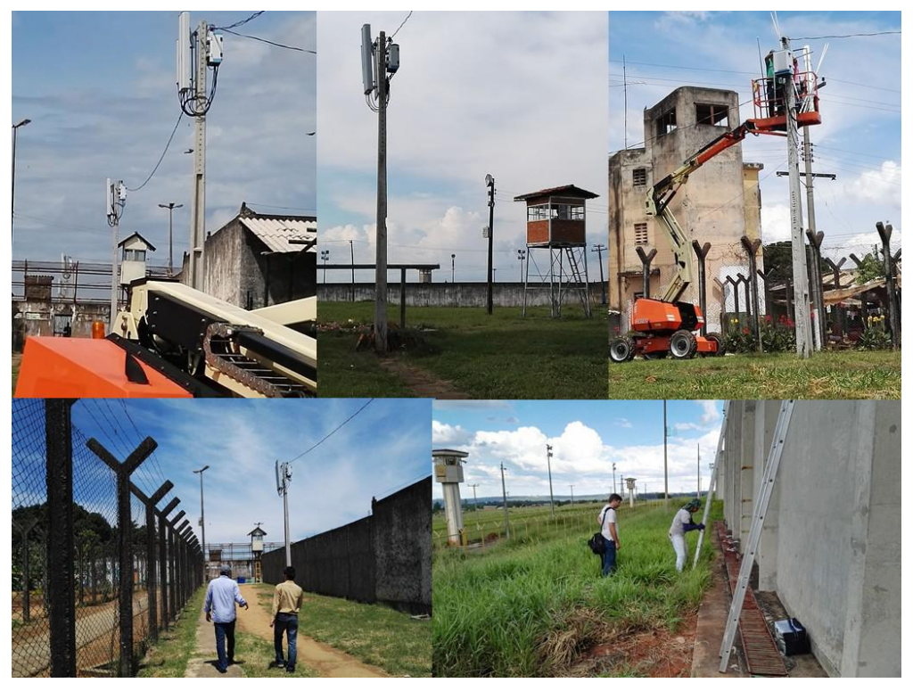
One prison in Brazil